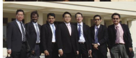
< Project Team outside the CIO Building in Bahrain.